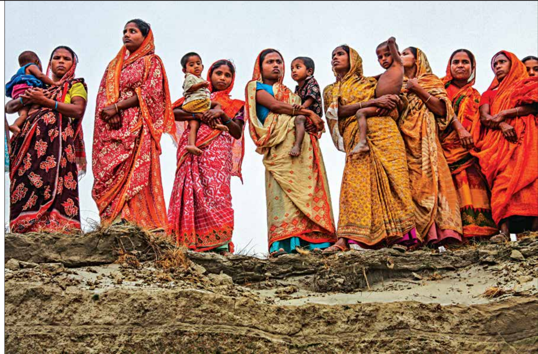
Kazir Char in Sirajgonj district. This region, next to the Jamuna , is primarily made up of silt (fine sand), making it very fragile. As men embark on work, only the women and children are left behind in the char . Men often cannot come back from the city in less than a week, leaving their women and children folk devoid of any health care, risking mortality and malnutrition. Kazir Char, Sirajgonj, March 09, 2009