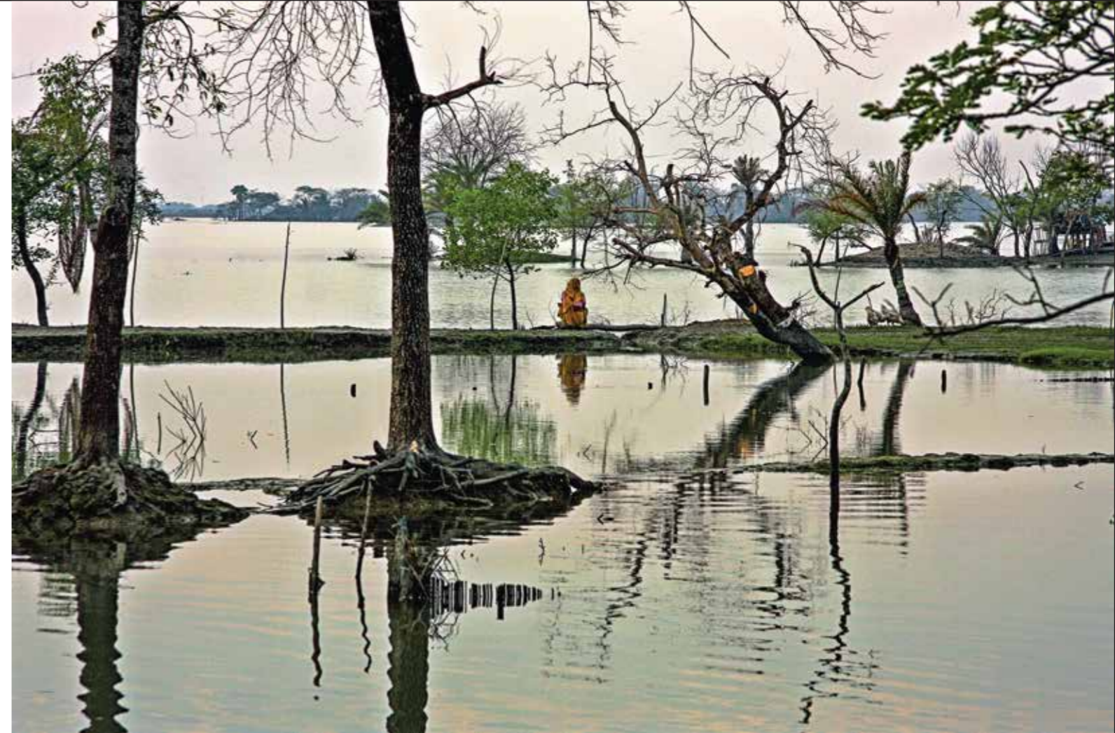
Gabura , a village in south-western Satkhira district, saw saline water trapped permanently after cyclone Aila (2009). All the cultivable lands gradually turned infertile. Most of the families have left in search of better livelihoods. Even the trees have been unable to stand on increased water salinity. All economic activities and communication structures have broken down. Gabura, Satkhira, November 05, 2009

To aggregate the efforts of the Government and civil society, Bangladesh needs extensive supports from development ►