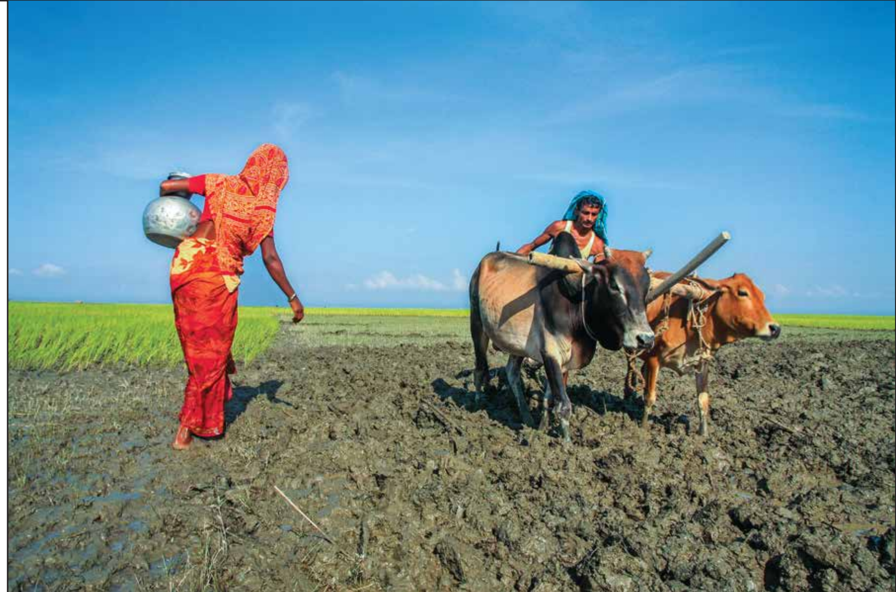
Datiar Char , a newly-emerged island on the Brahmaputra, northern Kurigram district. It is a most iconic image of traditional agricultural Bangladesh: farmers preparing the land with cow and a manual plough. The land is fertile, the soil is rock solid. The lady has carried hundred pitchers of water and poured down to soften the soil. Agriculture in Bangladesh continues to be dependent on nature. Datiar Char, Kurigram, September 02, 2009

Bangladesh Government took a number of initiatives to meet the challenges which include developing flood, drought and saline tolerant varieties by Bangladesh Rice Research Institute (BRRI), Bangladesh Agriculture Research Institute (BARI), Bangladesh Institute for Nuclear Agriculture (BINA) and other agencies.