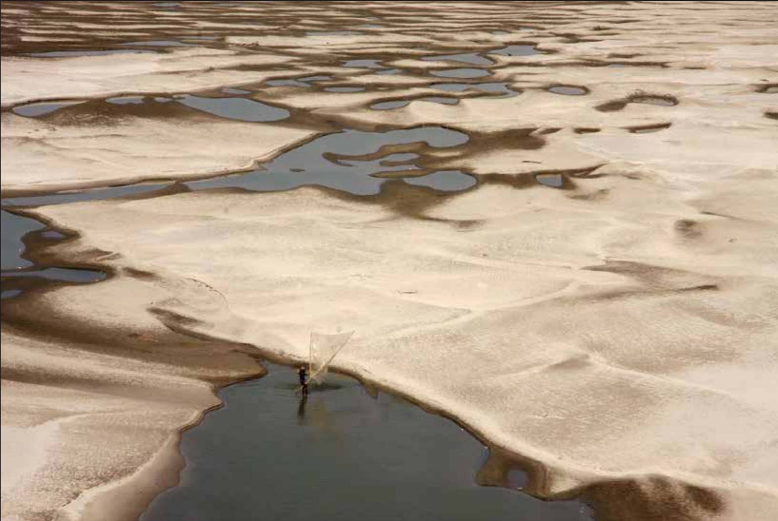
The Ganges - Brahmaputra – Meghna (GBM) river systems are the principal source of river water in Bangladesh. Building barrages upstream of the Ganges and the Teesta are affecting the climate across northern Bangladesh. Sizable tracts in northern Bangladesh resemble desert-like scene. Many tributaries of the GBM rivers have dried out and made much of the basin barren. Sharply contrasting flow leads to siltation and the rivers losing carrying capacity. During the peak of monsoon, the dried up rivers fail to respond to surge of water. Vast plains get flooded, causing massive devastation.