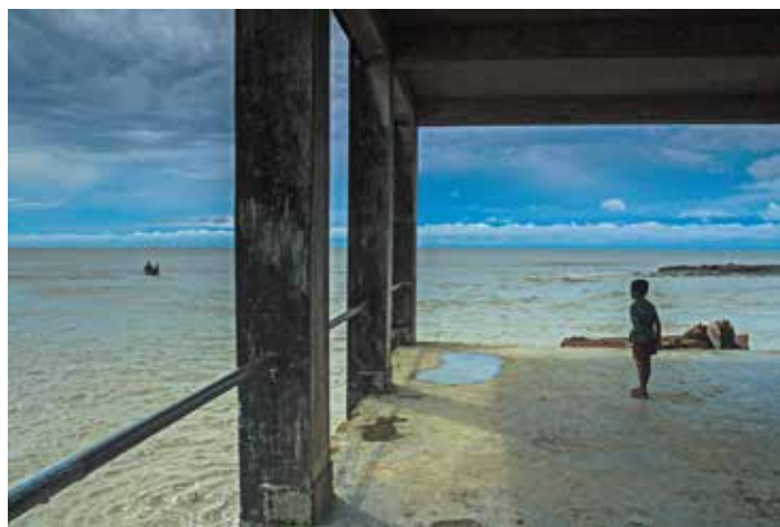
It was the Eid day in 2011 when the fragile and neglected embankment, that used to protect the villagers from the sea, collapsed and the entire village was washed away with saline tide. Like hundreds of other families, they took shelter in another local cyclone shelter cum primary school. ▶

▶ As all the homesteads have been washed away, some of the families have taken shelter in this school. They have to wait on the roof until the school time is over. Every student is present, they earn a packet of glucose biscuit at the end of their class. Their school is on the brink of getting devoured by the sea. No books were seen on the tables. The students explain, they are floating on the sea! Excessive carbon emission elsewhere cause the sea water to rise, due to which the children might soon lose their schools to learn from.