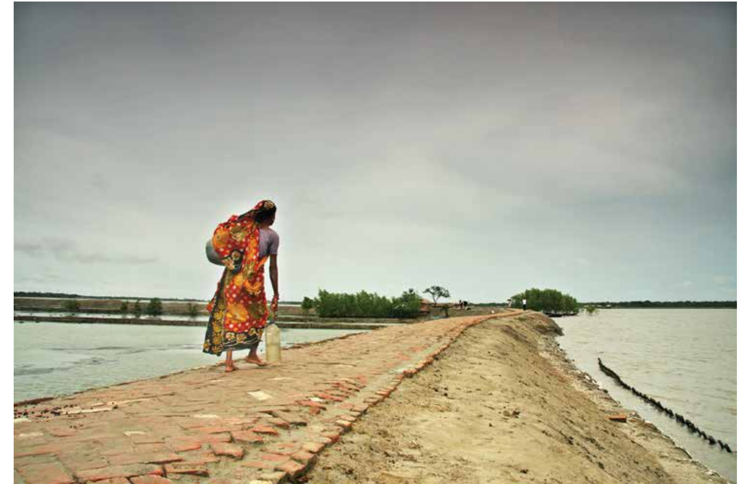
Chaitra and Jaishtha , the Bengali months of summer, has the worst weather for the people of Paranpur ( Shyamnagar sub-district, Satkhira ). The men are busy searching for drinking water. As the shrimp industry booms, the saline water does not leave much else for cultivation. Cyclone Aila destroyed their water system. Gabura, Satkhira, July 31, 2010