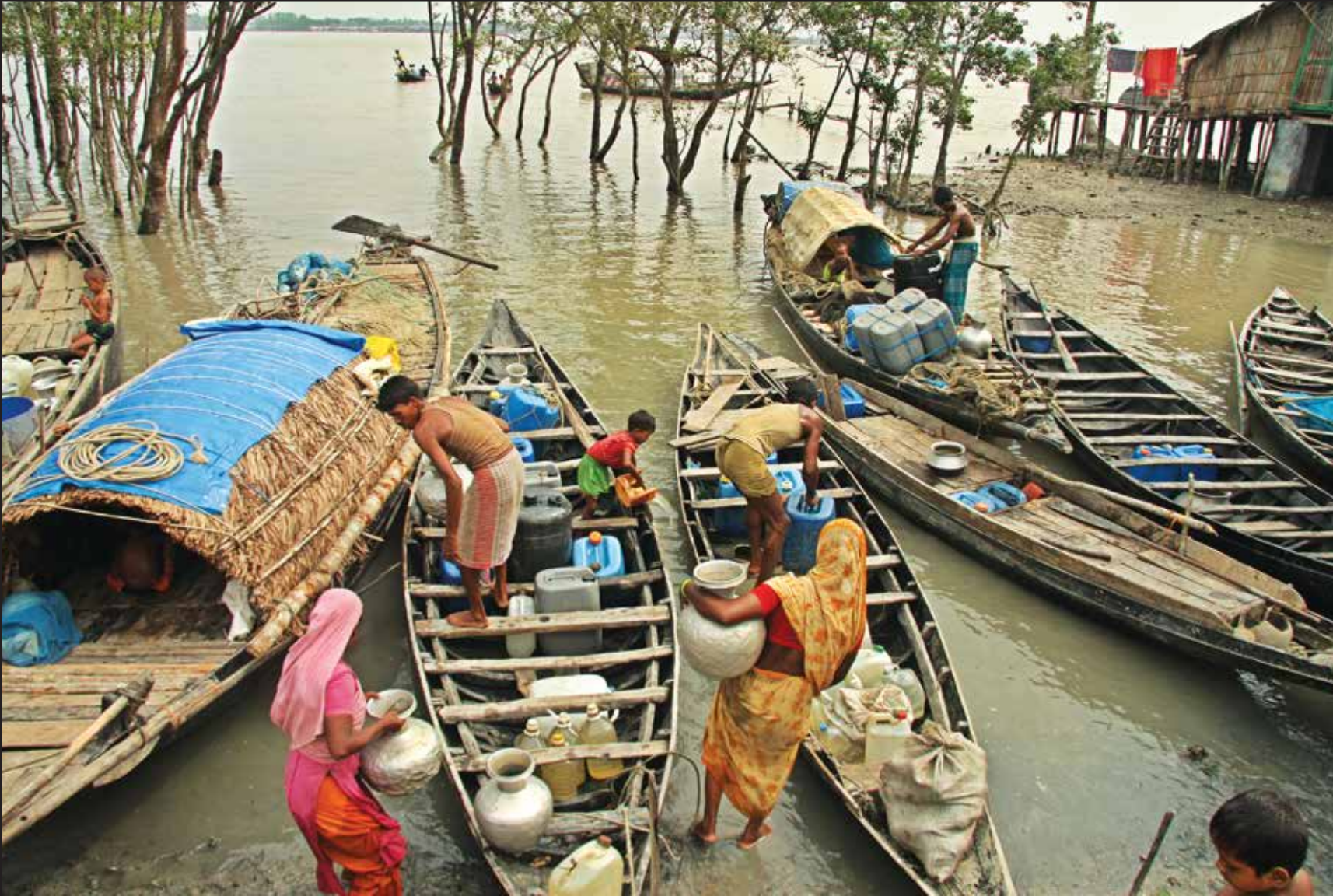
Many travel to this place - from as far as 15 kms - in search of drinking water. At least two members of each family need to dedicate themselves to this task. Years pass by, life goes on. Satkhira, November 05, 2009