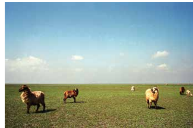
Dhalchar, Bhola, 2003