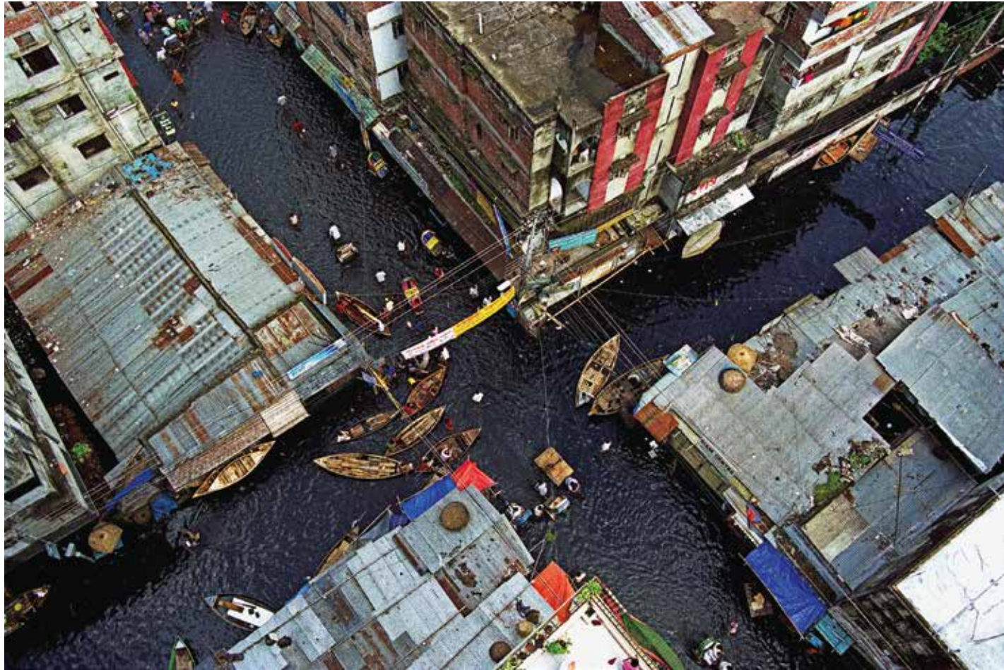
September, 2004. BBC reported that "...worst floods in decades hit Dhaka. Many roads are waist deep in water. Bangladeshi authorities have closed all government offices in the capital, Dhaka, as the worst flooding in decades hit the city."