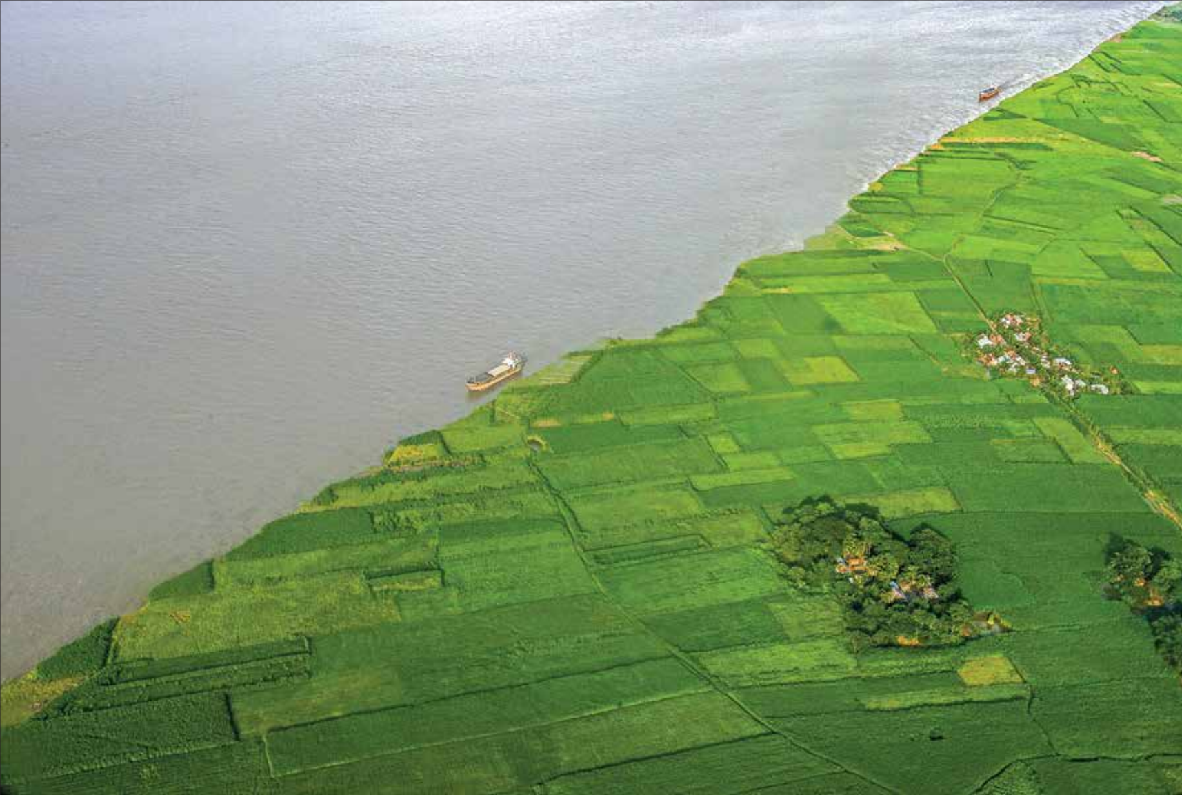
Patuakhali, a coastal district. It is a bird's eye view of the typical farmlands adjacent to the rivers across Bangladesh. The horizon of the landscapes always look green for the green crops on it. But, the rivers in the coastal area are getting wider day by day. They quietly gobble up thousands of hectares of precious agricultural lands every year. Patuakhali, June 17, 2015