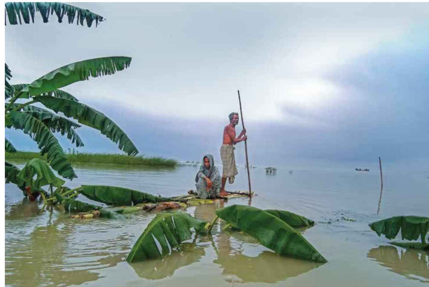
The massive flood in 2007 devastated northern districts of Kurigram and Gaibandha : river waters rose to such a level that the food chain of this region was completely destroyed. Food security was at risk. They took the raft ( made of banana plants ) around in search of food. Flood 2007, Kurigram, August 01, 2007

from natural disasters has declined. Through this process community level disaster management committees and volunteers create an example of people-oriented risk management in the world. But rapid changes and increasing severity requires more investment and infrastructural development at community level, which is the demand of Bangladesh to the international communities, along with reducing global warming.