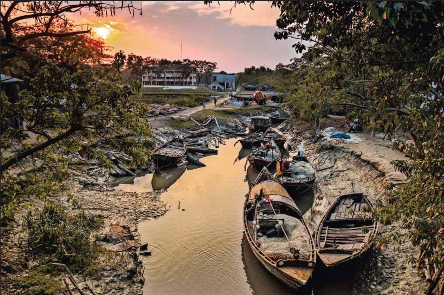
Porir Khaal i.e. Canal of Fairies is no longer any pretty. Today, this image doesn't exist in reality: the image exists only in the memories of the people of Dhalchar , many of whom claim that they had witnessed fairies here! Sea-water has overtaken the entire place here, including the school building. Dhalchar, Bhola, February 20, 2011