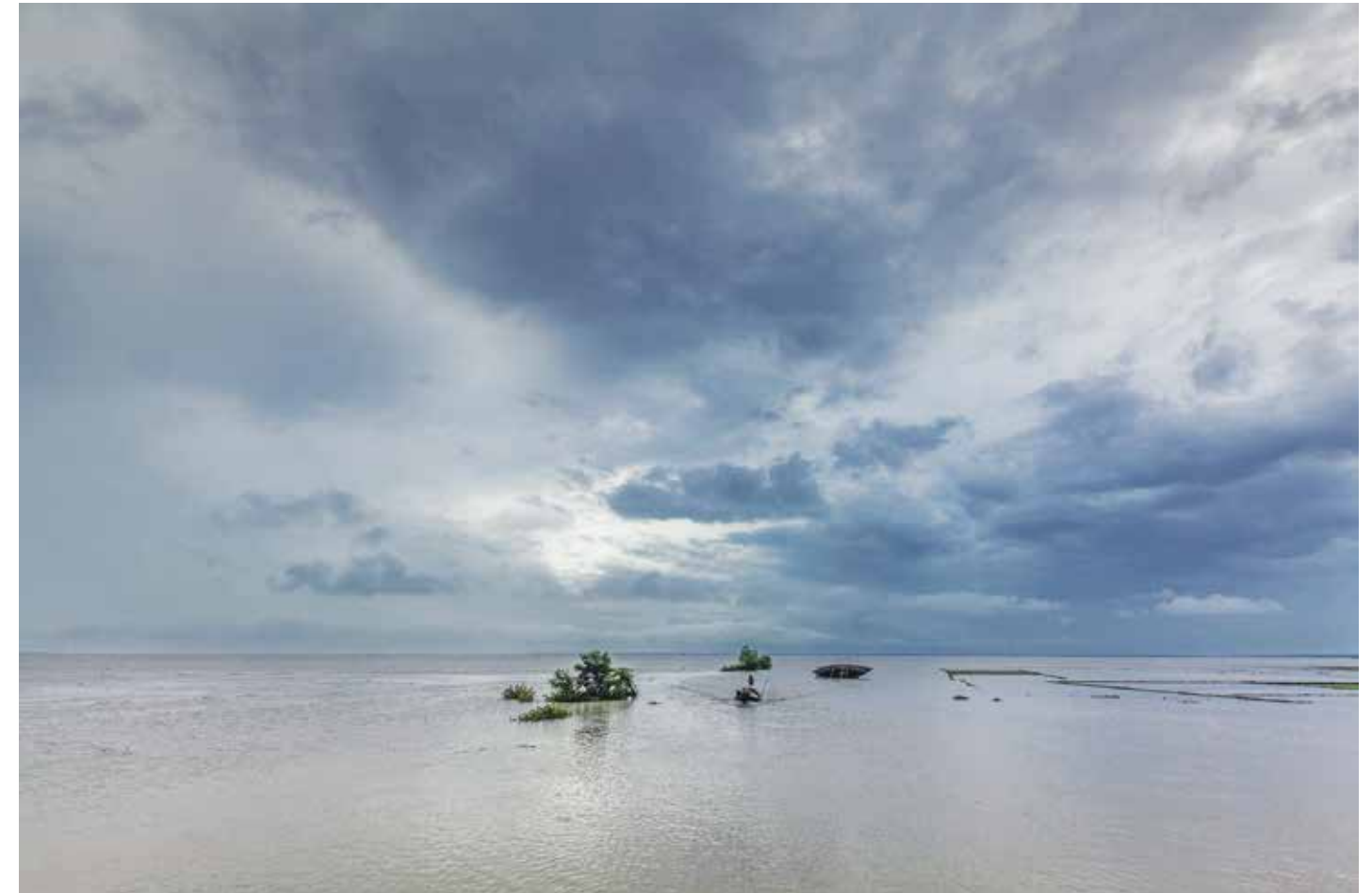
The River Meghna ends up in the Bay of Bengal, touching Dhalchar (Bhola District) and carrying some of its soil along with. Dhalchar has only one crop a year – sowed after monsoon and harvested before November. Two images are taken from the same place in the island: the left one on September 2014, and the one above in May 2015. The regular tide, twice a day, overflows the part of Dhalchar and seems like sea all over!