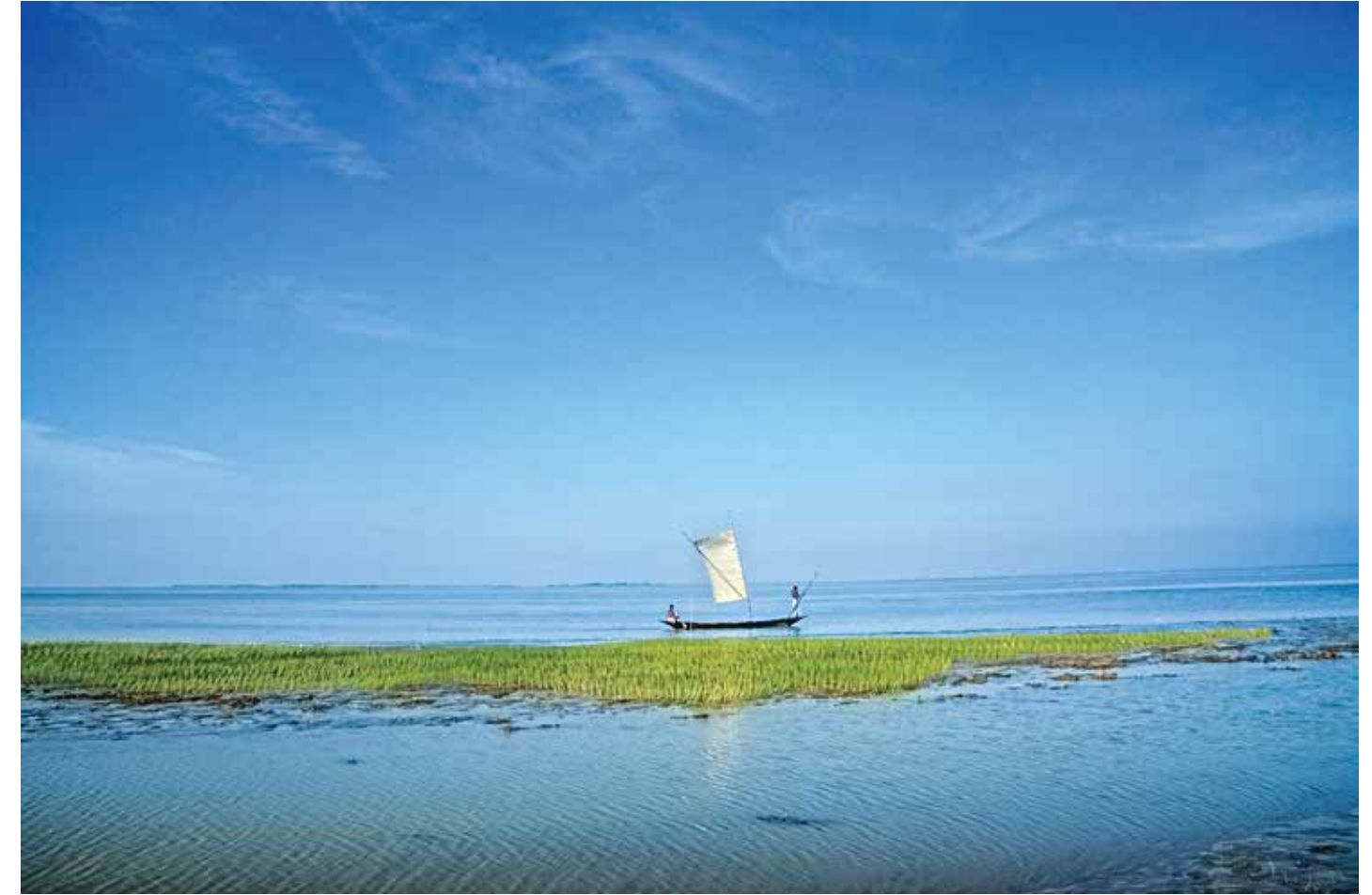
A piece of land in the Brahmaputra - where the soil was not hardened yet. A farmer puts paddy seedling hoping that, four months later, he would be able to harvest a handful of golden rice if the 'river god' is kind. Datiar Char, Kurigram, September 02, 2009