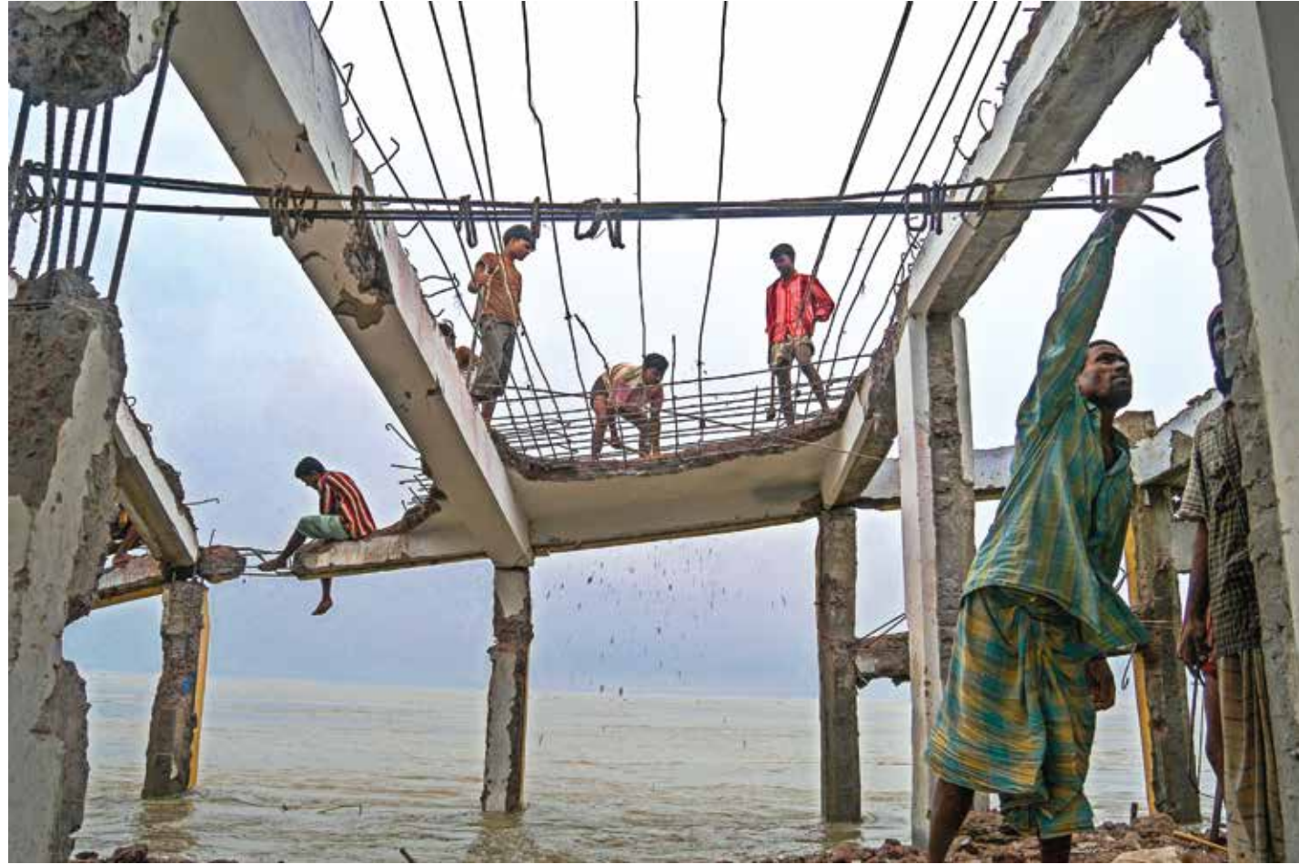
In Kurigram district, this school was deconstructed, brick by brick, as massive floods (2007) hit. They hope to save as much building materials as they could, so that it could be restructured at a convenient time. Flood 2007, Kurigram, July 31, 2007