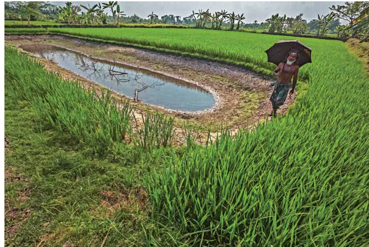
Tiger prawns farming is quite popular in the south-western region of Bangladesh (districts of Khulna, Satkhira, Bagerhat ). Farmers keep the seed prawns at the lower part of their land during the summer when water bodies dry up. They grow rice on the upper part at that time and harvest before monsoon. Water gets back in the monsoon and it starts the prawn again. Using the same piece of land in different season for different purpose is an innovation for the local farmers to cope with the changed circumstances. Bagerhat, March 26, 2015