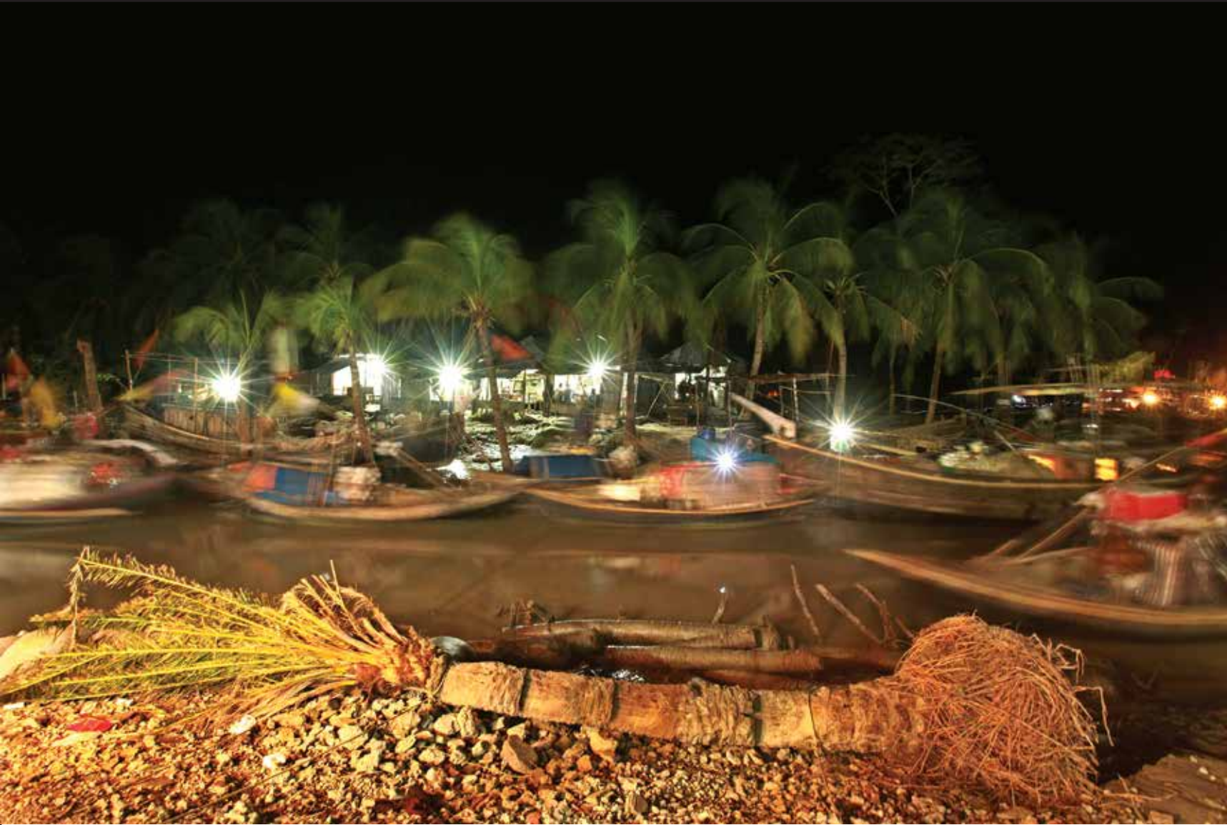
The market in Dhalchar can no longer be found in the map. The side of the island lost 2 kilometers length to the sea over the past 11 years. This market was established here 5 years back, and now very small part of it remains. Dhalchar Bazar, Bhola, September 13, 2014