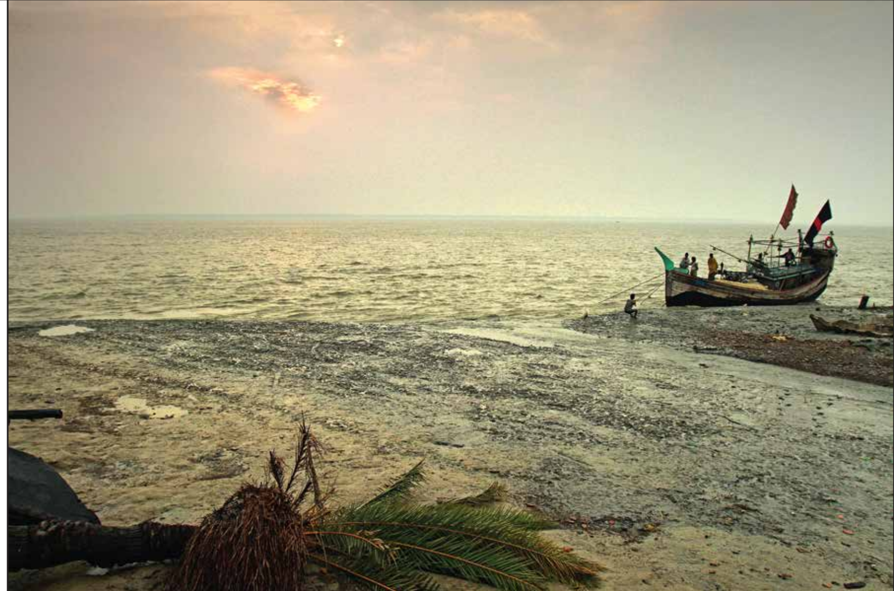
Bhola , the southern-most Bangladesh district harbors a small island, Dhalchar . The cyclones of 1991 and 2009 neatly devastated the island. Thousands of lives were lost. But, islands like Dhalchar saved millions of lives in the mainland. Planned forestation is mandatory to ensure the existence of such islands. A rising sea, which is a key impact of climate change, can put the island on the verge of extinction. River Meghna, Dhalchar, Bhola, February 21, 2011

To meet this challenge, the Government of Bangladesh has been implementing several projects to build mass-awareness, strengthen embankments and reconstruct protective infrastructures. Different partners including International Financial Institutions are providing loans and technical supports for the projects. But a massive program should be taken to build coastal dikes considering the projections of sea level rise for the next 50 years at the least.