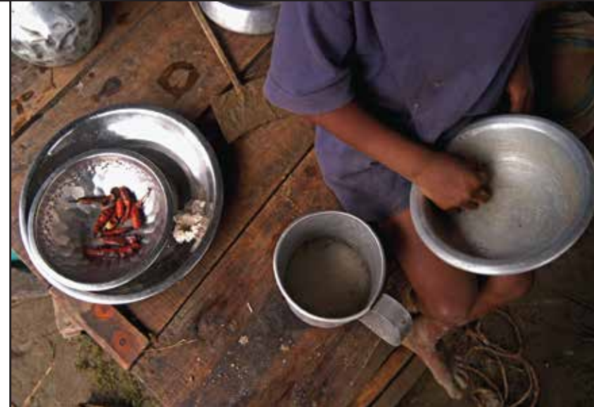
The monsoon flooding in Bangladesh is caused mainly due to upstream overflows of the Ganges and Brahmaputra river systems. After monsoon flood begins as soon as the stream subsides. The 2007 floods saw national rice production lost by 5 million metric tonnes. Peoples' meals in the flood-hit areas often shrink down to merely rice and dry red chillies. Men take raft rides in search of food; and women are left behind marooned.