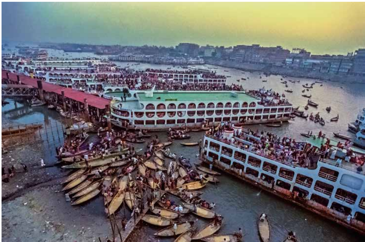
All in this crowd from the south, have been forced to come to the capital. These locally made launch-boats are the main transport for the southern coastal districts to connect to the capital. During the big vacations, the city fast gets empty and filled up again as the holidays are over: the people take the opportunity to go back to roots, meet their families and return to work in cities. Global warming contributes to displacement of people in the coastal districts. As a result, people move to the cities. In a democratic state, it is not possible to block such quiet movement of people. Surely, the cities and urbanizing Bangladesh face a challenge in providing housing to the extra population moving to the cities.