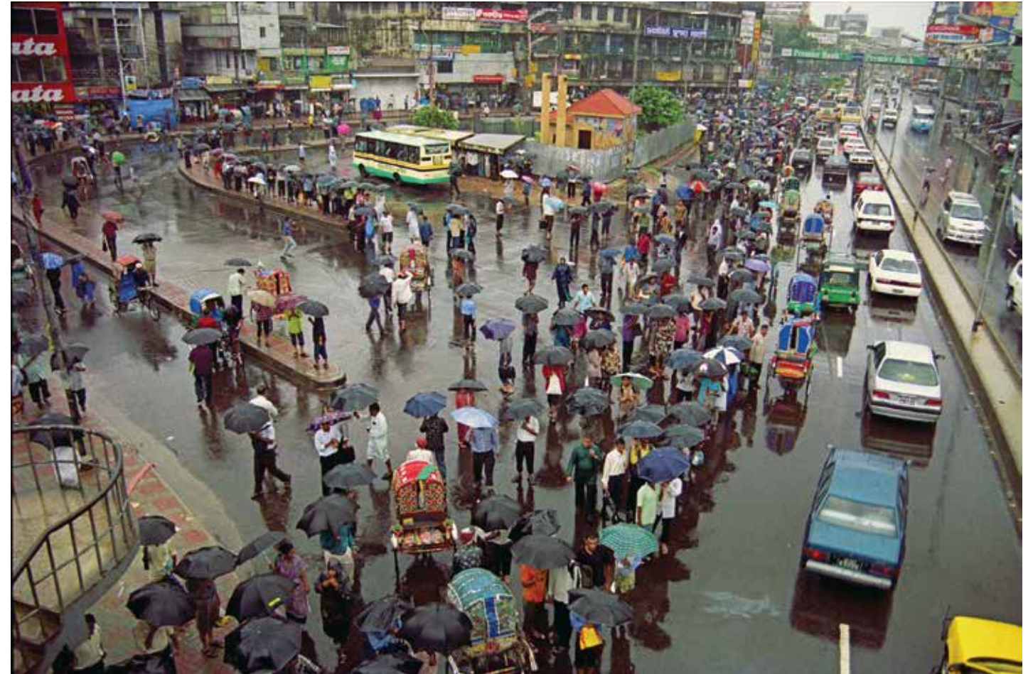
September 2004: incessant rain over one week had once immersed Dhaka city. Some areas became inaccessible without getting over by boat. Dhaka never witnessed it before. But, this has been happening ever since. Global warming is visibly changing intensity and periodicity of rainfall patterns and even onset and departure of monsoon.