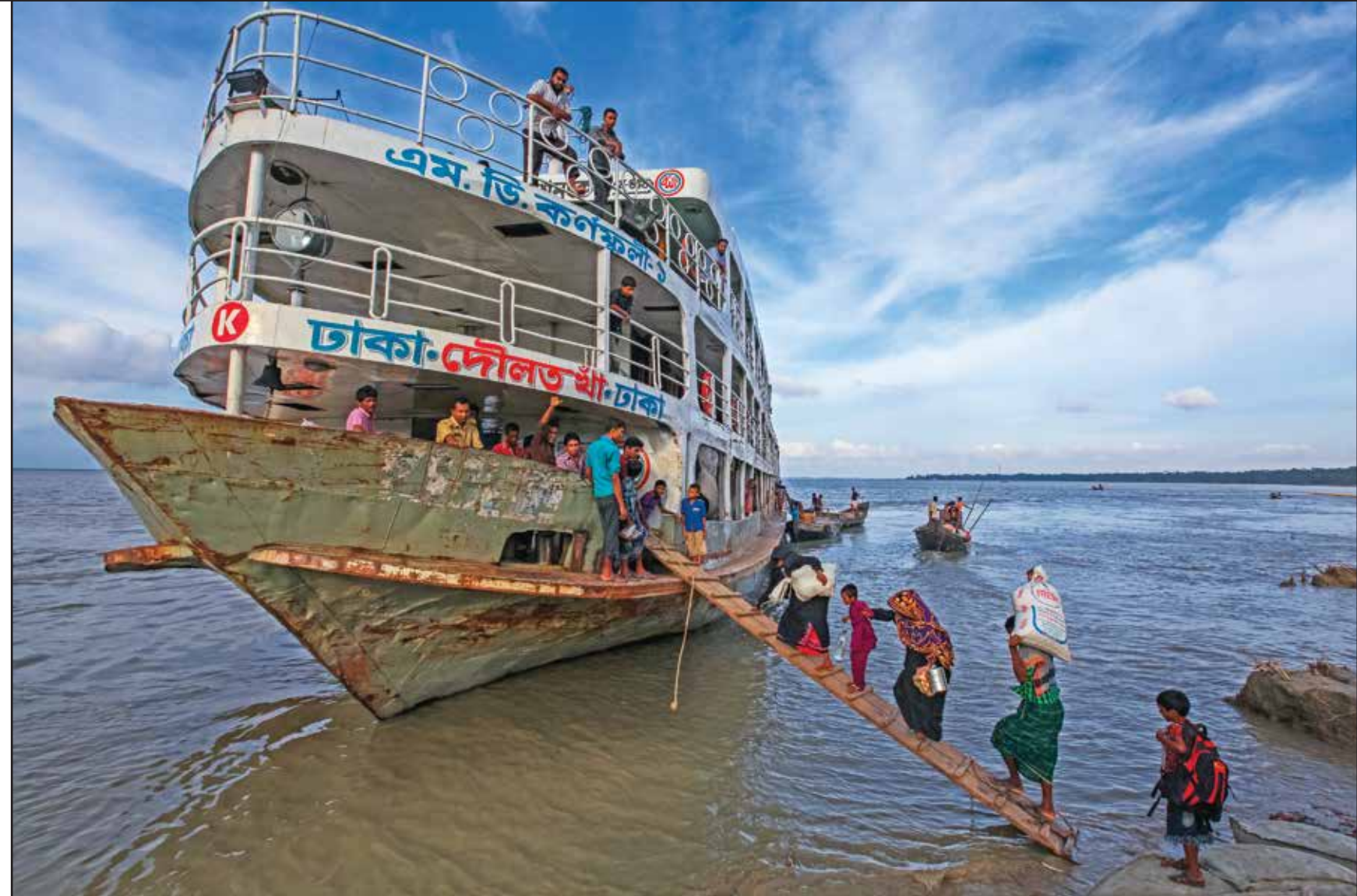
During the tides, both the coastal lands and the surface of the Meghna assumes the same length. As the coastlands gradually erode, the sea ports do not last long. As a result, most of the capital-bound launches can harbor anywhere; and anyone can leave for the cities for alternative earnings. Bhola, July 18, 2014