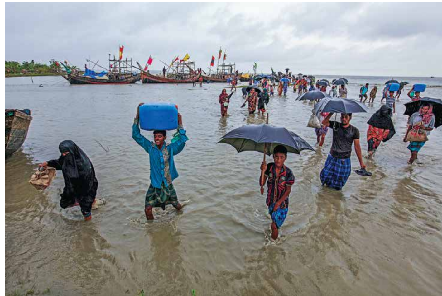
They could say: this was their second life. 150 of them, on an engine boat, to come to Bhola island for work, were floating away to nowhere across the Bay of Bengal as the propeller broke down. A rescue boat came out of the blue - much unexpected in that route when all the passengers already started to expect a confirmed death or permanently lost in the open sea. They were from Monpura , an island sub-district in Bhola . A 900-year old populous area, repeatedly pricked by the Meghna , is getting skinned this island off its arable land. South of this island gives direction to another char-isle, Kalatoli . A 40-minute journey by trawler has to abide the law of high and low tides and depend on the mercy of the nature even in this digital age. Char Monpura, Bhola, July 21, 2014