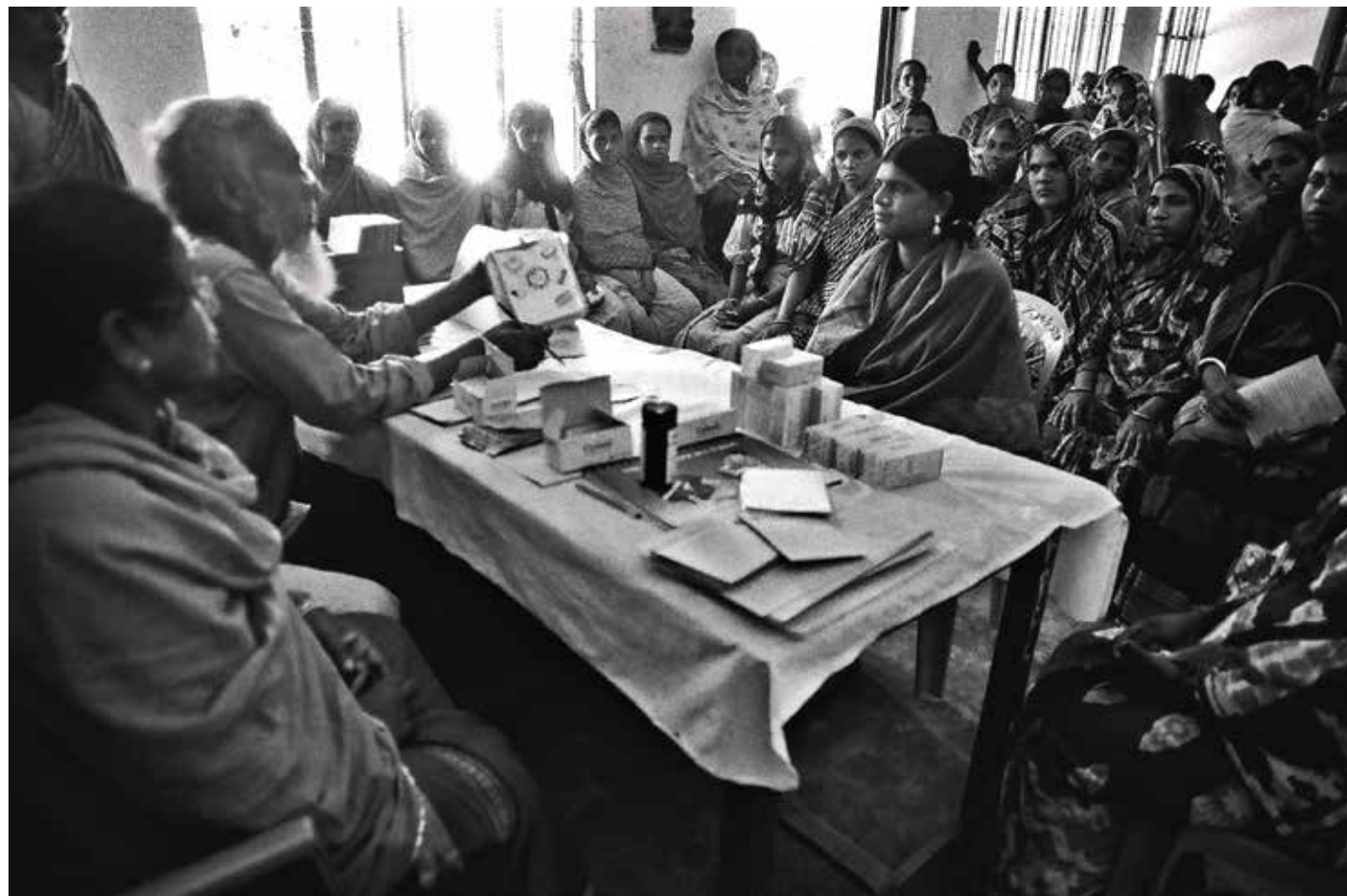
The contribution of the non-government organizations has enabled the women and children of rural families in distant locations to receive basic health care. Remarkable progress came through modest initiatives focussed on creating awareness about food intake and health issues e.g. use of toilets, providing vaccines, etc. Lalmohirhat, 2006