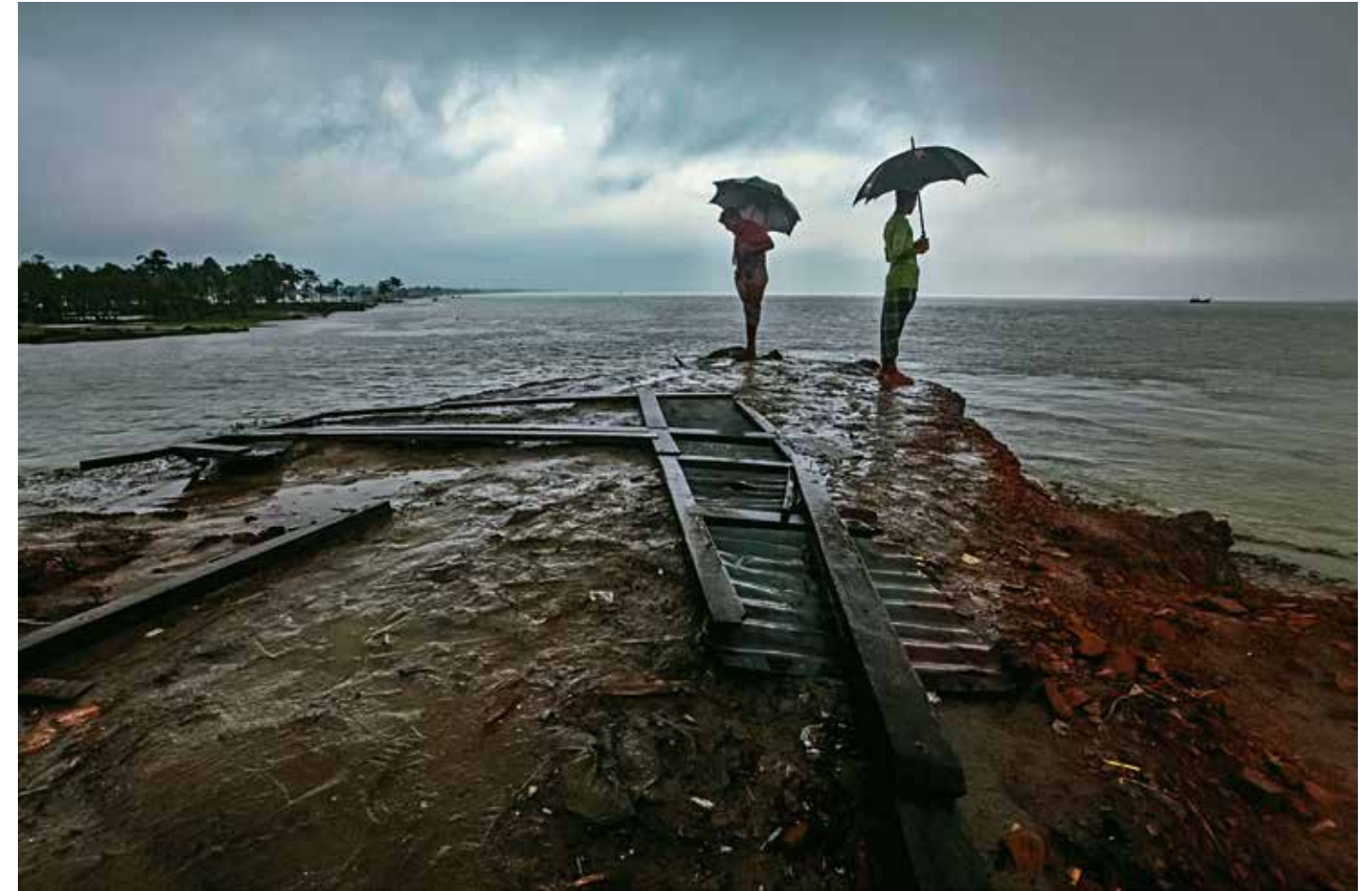
This used to be a fish market of Char Fashion , southern-most Bhola district. Home to over 50 artisanal fisher, three days of repeated high tides totally gobbled up this property up, even submerging an ice mill in the process. Samraj Bazar, Char Fashion, Bhola, June 26, 2015