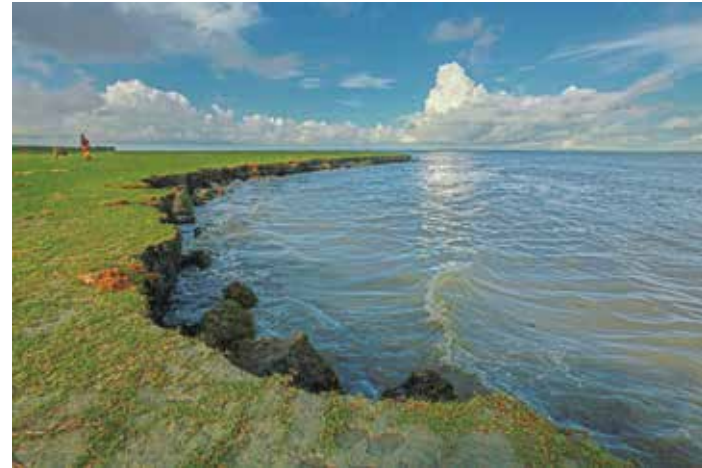
Paddy plants were about to bloom in Shahjahan Miah's farmland in the west coast of Dhalchar , against the deadly dancing waves of cruel Meghna . He got lucky to harvest in November 2014 before the erosion ( right ). But, this time, the river got a big bite on it ( left ).