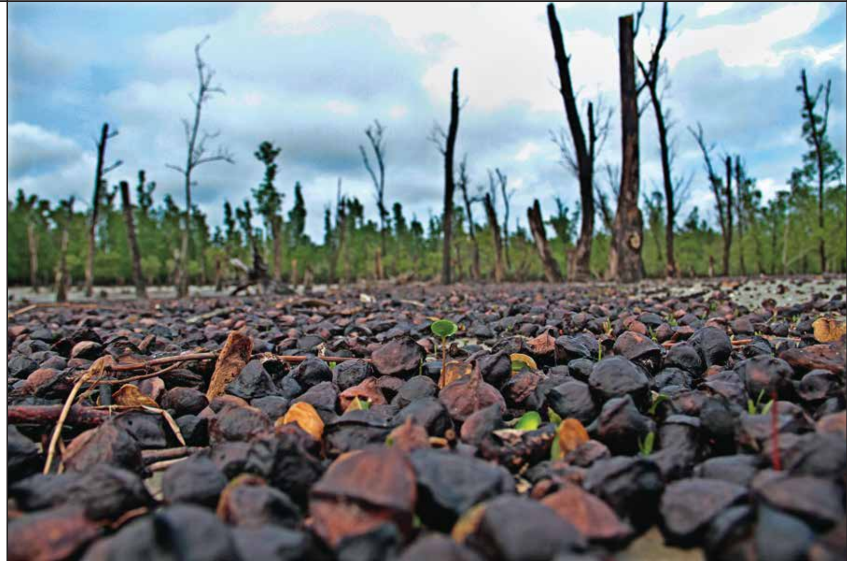
The deadly cyclone Sidr (2007) devastated one-third of the Sundarbans – the largest mangrove forest and world heritage (UNESCO). The same devastation was repeated in 2009 by cyclone Aila . It would take at least 30 years to re-generate naturally. Five years following Sidr , the rampant effects over millions of trees are still widely evident in the Sundarbans . Kotka, The Sundarbans, September 02, 2013

predicts that tiger habitat is likely to be declined 96% in Bangladesh's Sundarbans mangroves with a 28 cm sea level rise if sedimentation does not increase surface elevations 53 . Due to lack of freshwater and habitat shrinking along with other causes 54 population of Bengal Tiger, one of the world's endangered species, has already been reduced from 440 in 2004 to 106 in 2015 55 . Other forests including Sal Forest ( Shorea robusta ), Rainforest (Lauachhara) and Hill Forest (Chittagong) are also under threat due to change in weather pattern, especially change in precipitation 56 .