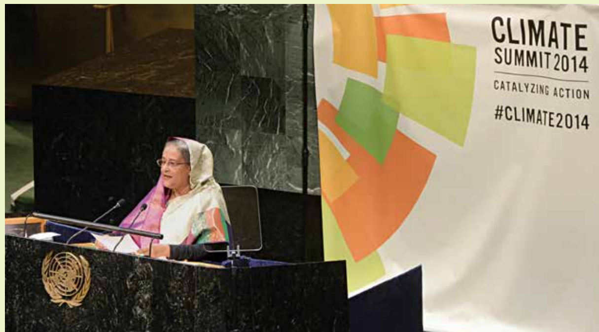
Sheikh Hasina Honorable Prime Minister Government of the People's Republic of Bangladesh

“For millions of our people, climate change challenges their lives and livelihoods. Rising intensity and frequency of flooding, storm surge, salinity intrusion and gradual changes owing to climate change are affecting millions along our coast. Many of them are compelled to move out; and even change traditional means of livelihood. Most of our development efforts and gains are at stake due to climate impacts. In recent years, Bangladesh has taken a number of key steps e.g. we have installed 3.2 million Solar Home Systems, provided over 1.5 million Improved Cook Stoves across Bangladesh. We are working on development of stress-tolerant crop varieties. .... Despite being a climate-vulnerable LDC, we allocated 385 million US dollars the Fund for adaptation and mitigation, with our own resources. Many eco-system based community-based adaptation measures have also been put in place.