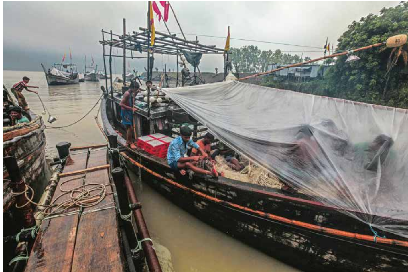
Most of the coastal localities offer the same picture: the fishermen have to get into fishing boats even in rain or storms in the sea. These days, the sea is changing and harvest is no longer good. Rising frequency and intensity of cyclones and storms in the sea most often bar them to go for fishing. In the wake, they again turn to take Dadons (local loans, with steep interest), with earlier ones unpaid in fish markets.

Samraj Bazar, Char Fashion, Bhola, June 26, 2015